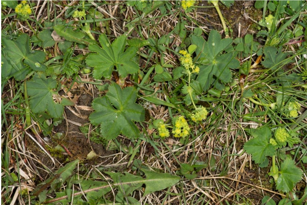
Figure 3. Alchemilla sciura on The Cairnwell

In the field (Fig. 3) the blue-green colouration of the upper-leaf contrasting with the silvery-white hairs on and emanating from the teeth; the leaves twisted and contorted, with distinctly separate, spiky looking teeth, give the plant a very distinctive appearance. As with many Alchemilla taxa, however, it should not be assumed that leaf colouration will remain constant.