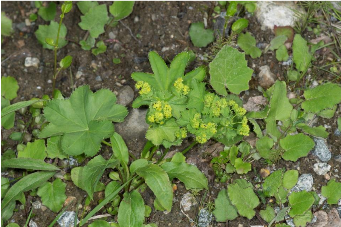
Figure 4. Alchemilla taernaensis near Tärnaby, Sweden