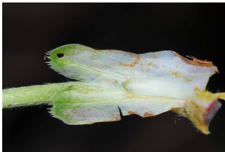
Figure 2. Alchemilla sciura basal leaf stipule