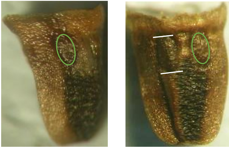
Figure 3. Left: achene number 2 from Table 2 (one gland shown, outlined in green). Right: achene number 7 - the shorter of the two glands on the right of the achene has been outlined in green to show the more elongate shape; the one on the left is a bit longer and the length is highlighted by the white lines. Note the thick ribs even on the abaxial surface.