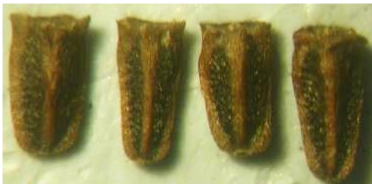
Figure 1. Achenes of Tripleurospermum inodorum (from waste ground of Skelton services: SE35183100, v.c.64. 09.10.2021). Average size of 10 achenes was 1.6 x 0.75 mm. The width of the dark brown areas between ribs is \pm greater than the width of the narrow ribs. All the oil glands were small and distinctly rounded.