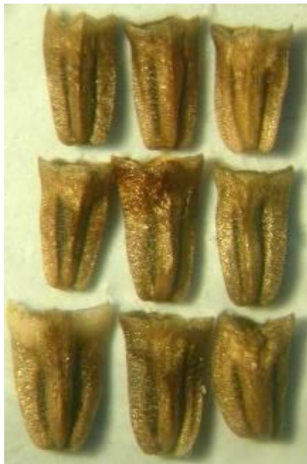
Figure 4. Achenes of a second intermediate plant from the study site.

The phyllaries of putative hybrids from Bradford did not seem that different to those of pure T. inodorum from Skelton services (Fig. 1). Thus the phyllaries (at least in this study) seemed to offer little scope for distinguishing the two species or hybrids (but see Crossley et al. , 2021). Introgression is likely to blur any distinction further.