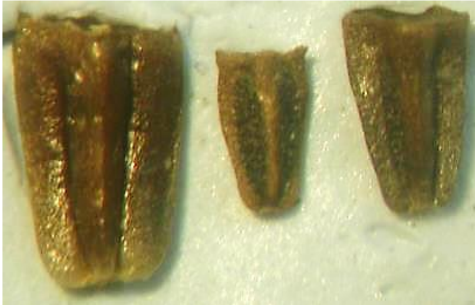
Figure 5. A direct comparison of achenes from the three Tripleurospermum taxa: T. maritimum from Hightown (left, actual size: 3.2 x 1.85 mm), T. inodorum from Skelton (middle), and a putative hybrid from Bradford (right). In the latter note the thickened ribs and offset spacing between them.

some had more acute apices with a longer apiculus but they were generally obtuse and not fleshy. If T. maritimum has the blunter leaf segments, then the putative hybrid plants from Bradford clearly show aspects of that taxon. In fact, with the achene characters and the type of leaf-tips it suggests the Bradford plants (rather than being fully intermediate) are closer to T. maritimum than T. inodorum .