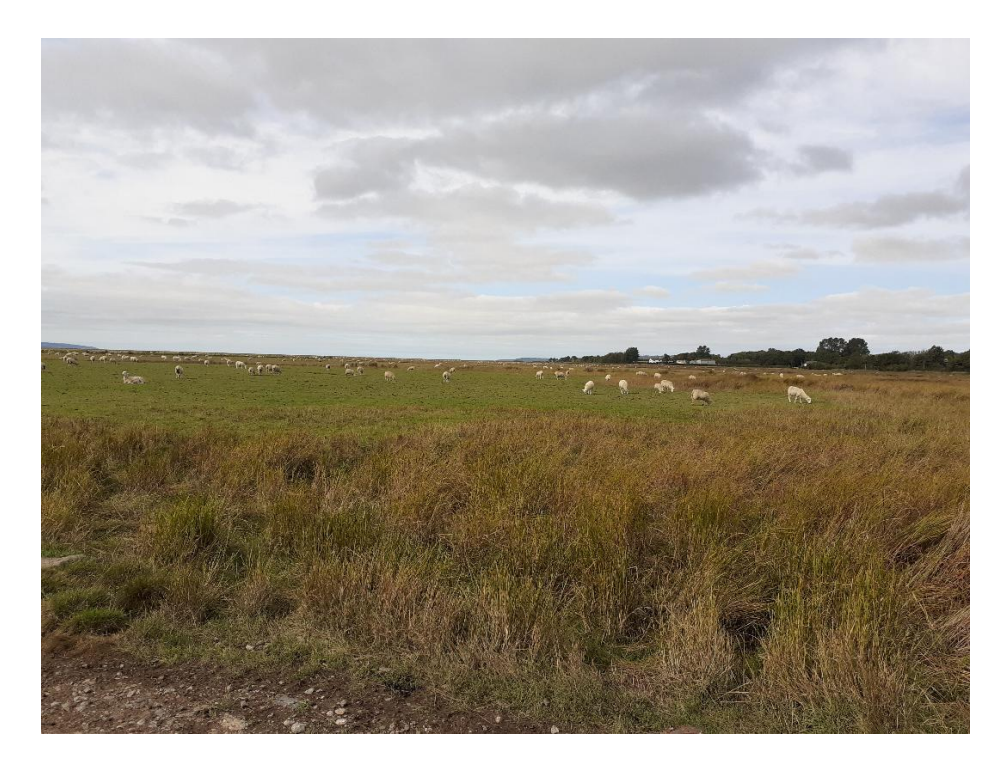
Figure 5. Burton Marsh looking downstream towards Ness with sheep grazing a Lolium perenne pasture. Bolboschoenus maritimus in foreground

Between Burton and Neston, the upper marsh zones are characterised by grasslands dominated by Lolium perenne with Trifoium repens and a little Potentilla anserina in damper patches interspersed, perhaps on slightly lower land, with Elymus spp. (Fig. 5). The marshes at Burton have been grazed by sheep since the end of the 19<sup>th</sup> century with up to 1600 animals on the marsh in summer (Booth, 1984). Many fewer are kept on the marsh today (Graham Jones, RSPB, pers. comm.). Elsewhere, as at Parkgate, cattle have been occasionally grazed on the marsh (Collard, 2022) but otherwise the marshes are not grazed. Aerial photographs suggest that the Lolium perenne grasslands follow a line of old sand banks.