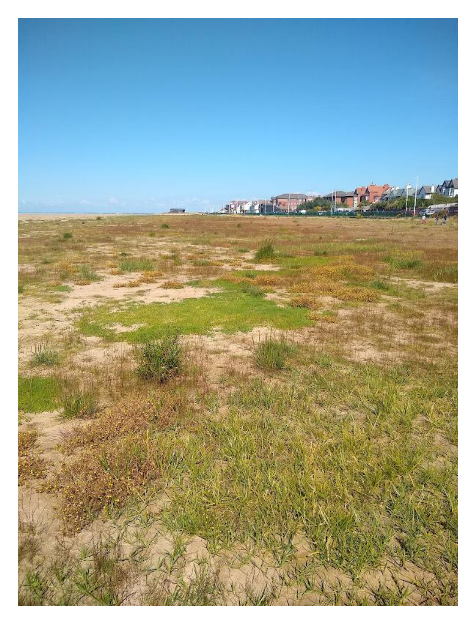
Figure 6. Hoylake Beach looking north towards the lifeboat house. Puccinellia maritima in foreground, Honckenya peploides in middle distance with yellow-flowered Cotula coronopifolia beyond.

Thus, following concerns over the spread of Spartina anglica on the Dee marshes, Hoylake Parks and Foreshore Committee was worried at the spread of Spartina anglica on to Hoylake Beach. An article and photograph showing patches of Spartina anglica on the beach was published in the Liverpool Echo ('Racing grass causes creeping fear'. Liverpool Echo 12 November 1960).