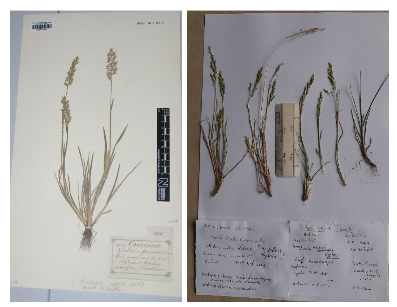
Figure 10. Puccinellia rupestris gathered in Birkenhead in 1872 by Robert Brown (left), and by the author at Rock Promenade, Rock Ferry in 2022 (right). Key characters for the Rock Promenade plant: Inflorescence more or less one sided, short panicle branches remaining erect, Lemma 3 mm, upper leaf margin minutely scabrid, leaves 2 -3 veins on either side of mid-rib

This is a well-known species of sand dune slacks in western Britain from Devon to southern Cumbria. Its occurrence in North Wales has been patchy and was apparently absent for many years (Wynne, 1993). It is a patch-forming, clonal perennial and entirely dependent on mycorrhizal associations yet in recent years it has spread into new sites and sometimes into inland Open Mosaic Habitats. However, at any one site it is often ephemeral disappearing after a few years. It was first recorded at Red Rocks in 2017 but it remains to be seen how long it persists.