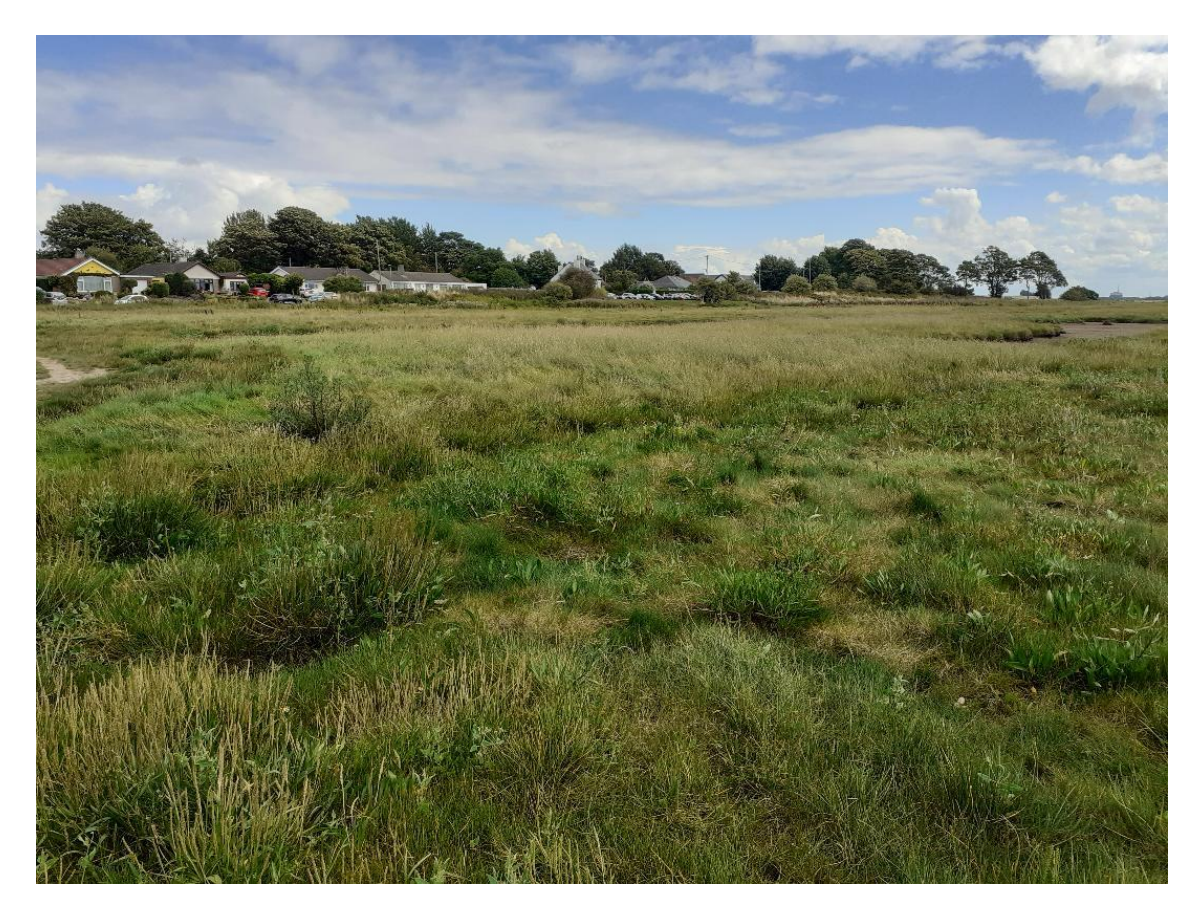
Figure 3. Neston mid-marsh salt-marsh communities with Elymus x drucei in middle distance

The vegetation of the salt-marshes today is very different to that described by Marker (1967), Taylor & Burrows (1968) and even Huckle et al. (2000, 2004). It is also much more complex. Silting of the estuary continues and the beach levels continue to rise. The pioneer coloniser of bare mud is Spartina anglica with some Salicornia spp. (SM6 Spartina anglica salt-marsh community sensu Rodwell, 1991-2000). Behind this zone is a very wide and complex zone of mid-marsh communities with Puccinellia maritima, Tripolium pannonicum, Suaeda maritima and Cochlearia spp. (see below), which can be seen at Heswall and West Kirby. However, it appears that as the marsh matures it becomes dominated by large areas of Bolboschoenus maritima (S21 Scirpus maritimus swamp) in wetter areas and the sterile Elymus x drucei in near monocultures (Figs. 3 and 4).