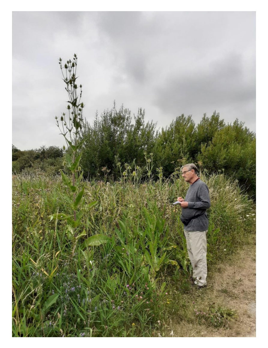
Figure 11. Dipsacus laciniatus . The author recording one of the more spectacular recent arrivals at Bidston Marsh.

Spartina anglica. Nevertheless, such changes could not have taken place if there had not been an ongoing tendency for sediment accretion on most, but not all, parts of the coast. These opportunities were given further impetus by the development of new Open Mosaic Habitats. Here, a few alien plants have taken the opportunity to become established, e.g the spectacular Dipsacus laciniatus (Fig. 11).