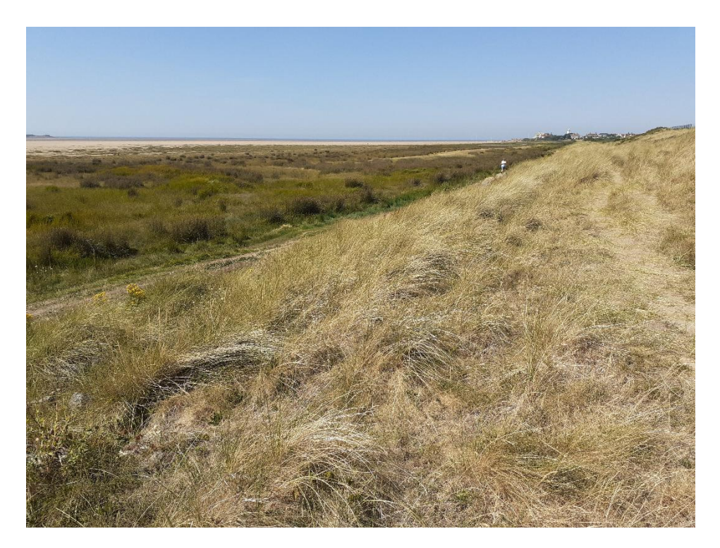
Figure 7. Red Rocks looking downstream towards Hoylake. Ammophila arenaria covered dunes in foreground; developing salt-marsh beyond.

dune ridges, SD10 Carex arenaria dune community has developed with Festuca rubra often abundant (Fig. 7).