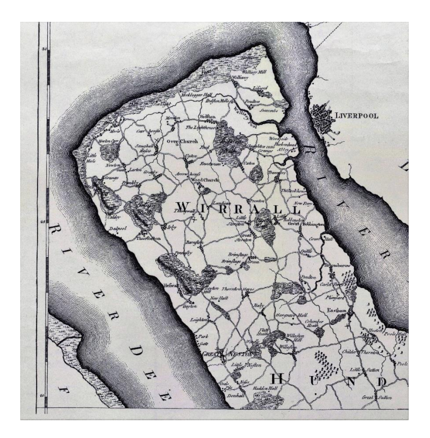
Figure 1. Burdett's map of the Wirral peninsula, part of his map of Cheshire 1777.