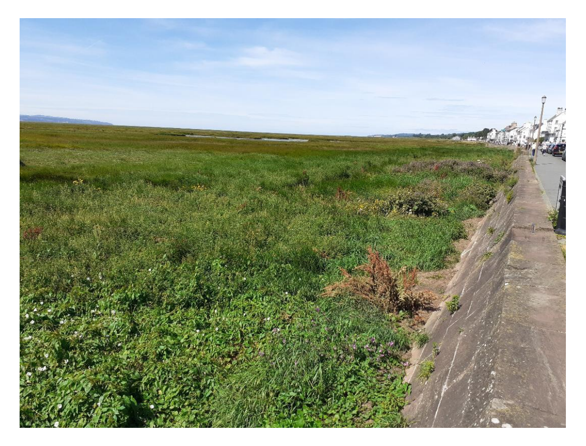
Figure 4. Parkgate upper salt-marsh tall herb communities with Calystegia sepium in foreground and Bolboschoenus maritimus in middle distance

this possibility in relation to Morecambe Bay marshes. Rodwell (2000) recognised SM24 Elymus pycnanthus salt-marsh community but this covers both the mid-marsh zones now known to be dominated by Elymus x drucei and a narrower zone at the top or strand line of marshes which is dominated by Elymus athericus, a situation recognised by the Essex Wildlife Trust (Anon, undated).