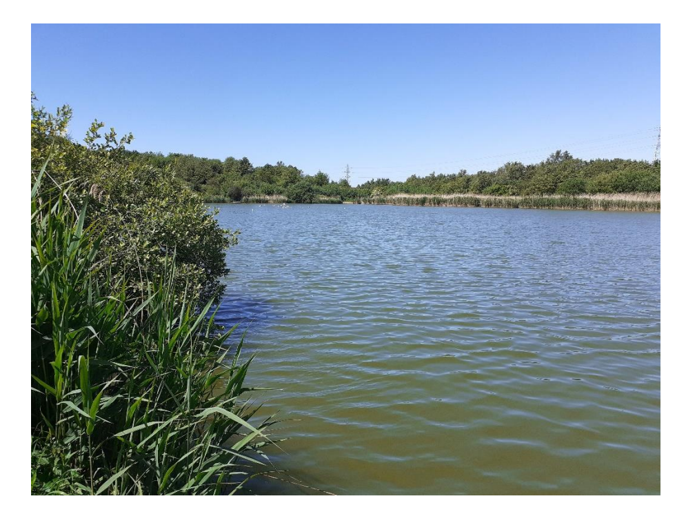
Figure 9. Photograph of the `fishing lake' Bidston Marsh looking towards the approximate location of the photo taken in 1902 (Figure 8)

Table 1 lists 31 species that were recorded from Bidston Marsh in the 19<sup>th</sup> century and that have been recorded since 1994. Table 2 records 28 species found in the 19<sup>th</sup> century but not since 1994 and are presumed lost. Fifteen (55%) of the 'lost' species show at least some tolerance to salt water and are characteristic of brackish or salt-marsh habitats, habitats that no longer exist at Bidston. It is also probably notable that 'lost' species generally favour more nutrient poor substrates than those that are still present. Most of the 'lost' species are typical of fresh water or wet grasslands but two, Coincya monensis and Hordeum secalinum are more typical of sandy ground. Both are still found nearby at Leasowe. Interestingly although no longer directly influenced by tidal inundation fourteen (45%) of the species still present at Bidston Marsh show some degree of salt tolerance. What is perhaps remarkable is that despite the massive changes over 50% of the former flora remains or has re-colonised the Marsh.