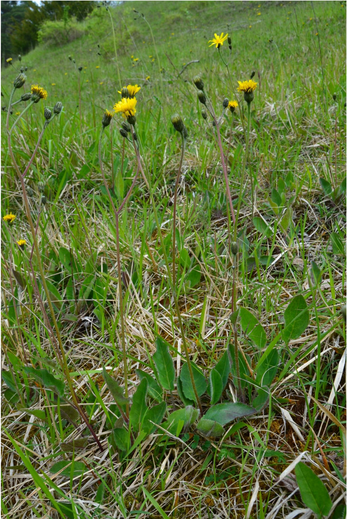
Figure 2. Hieracium elizabethae-reginae