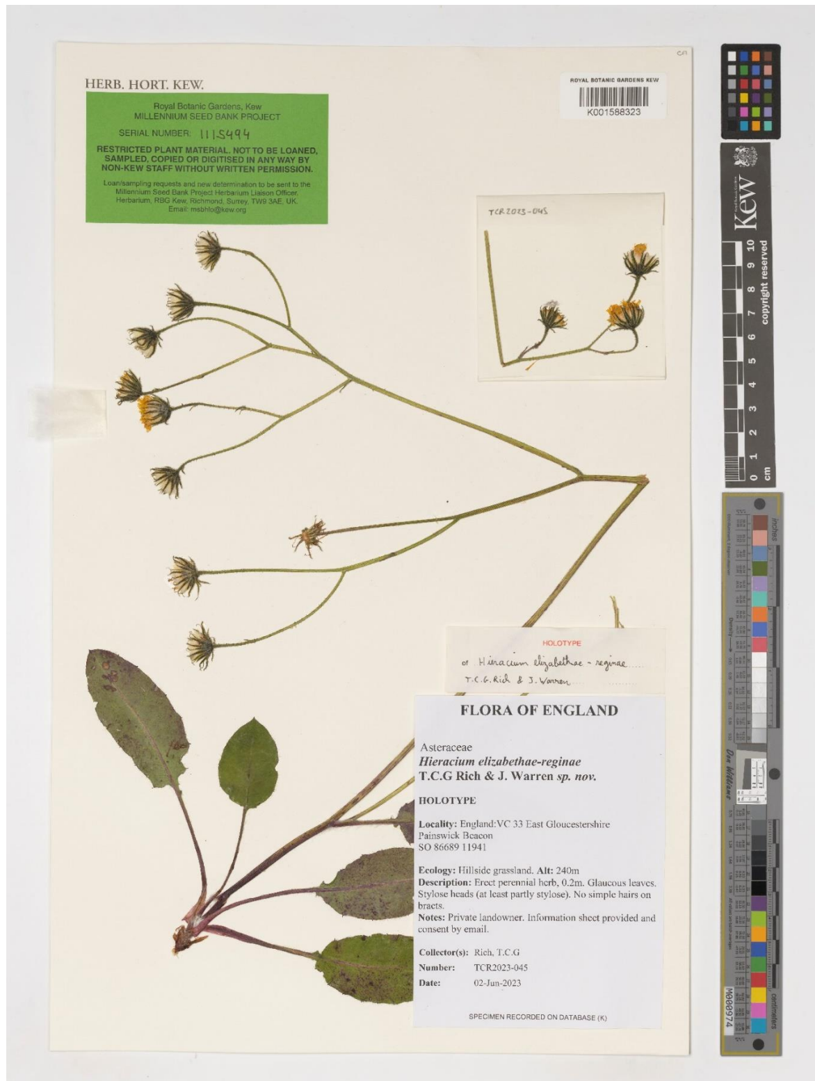
Figure 1. Holotype of Hieracium elizabethae-reginae (K)

simple hairs on the involucre bracts (Sawtschuk & Rich, 2008). We have traced no other specimens in BM , BRISTM , CGE or NMW .