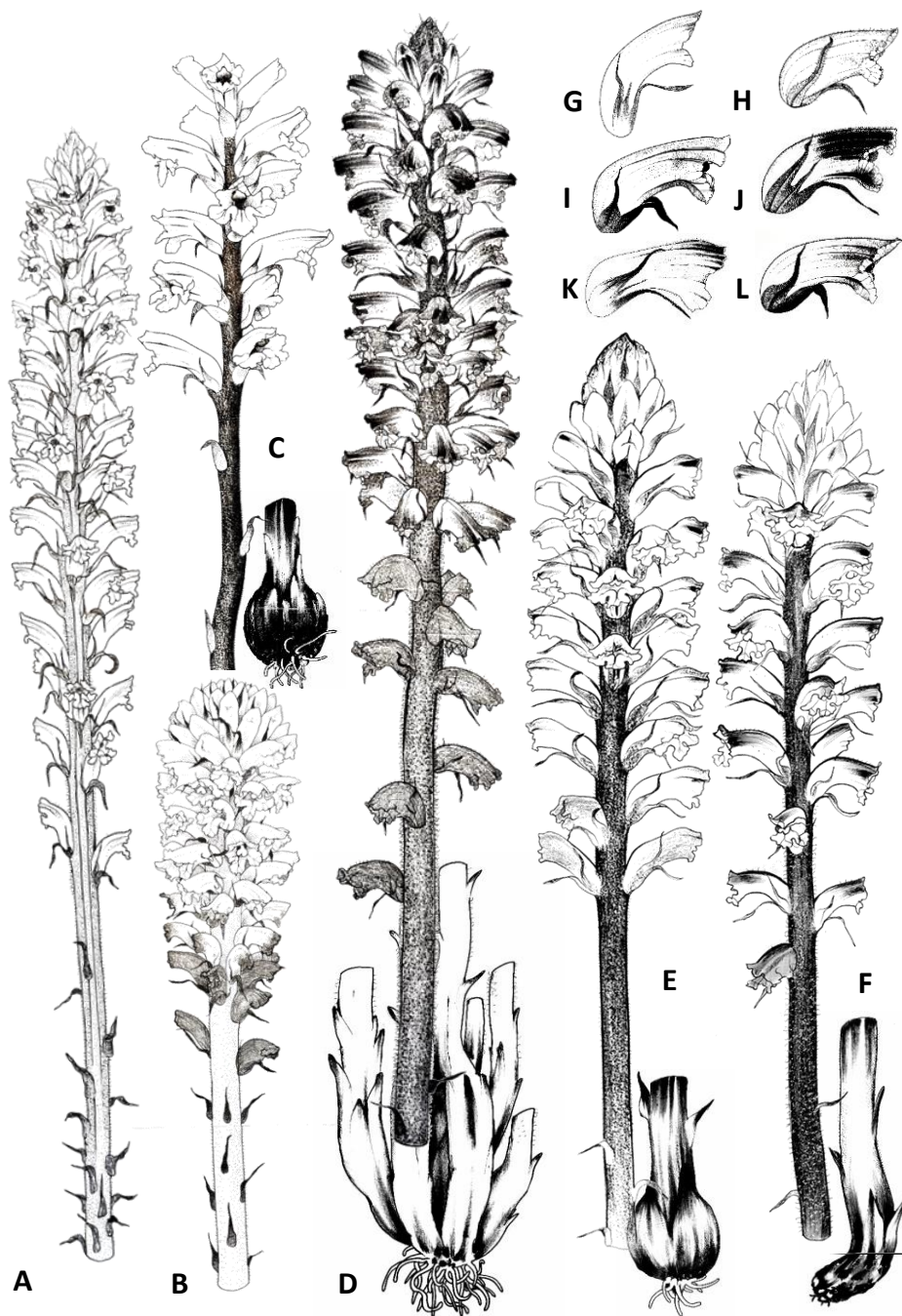
Figure 3. The intraspecific taxa of Orobanche minor in the British Isles (A-F: the habit; G-L: corolla in profile). A. O. minor subsp. minor var. compositarum . B. O. minor subsp. maritima var. hypochoeridis . C. O. minor subsp. maritima . D. O. minor subsp. minor var. heliophila . E. O. minor subsp. minor var. pseudoamethystea . F. O. minor subsp. minor var. minor . G. O. minor subsp. minor var. compositarum . H. O. minor subsp. maritima var. hypochoeridis . I. O. minor subsp. maritima . J. O. minor subsp. minor var. heliophila . K. O. minor subsp. minor var. pseudoamethystea . L. O. minor subsp. minor var. minor .