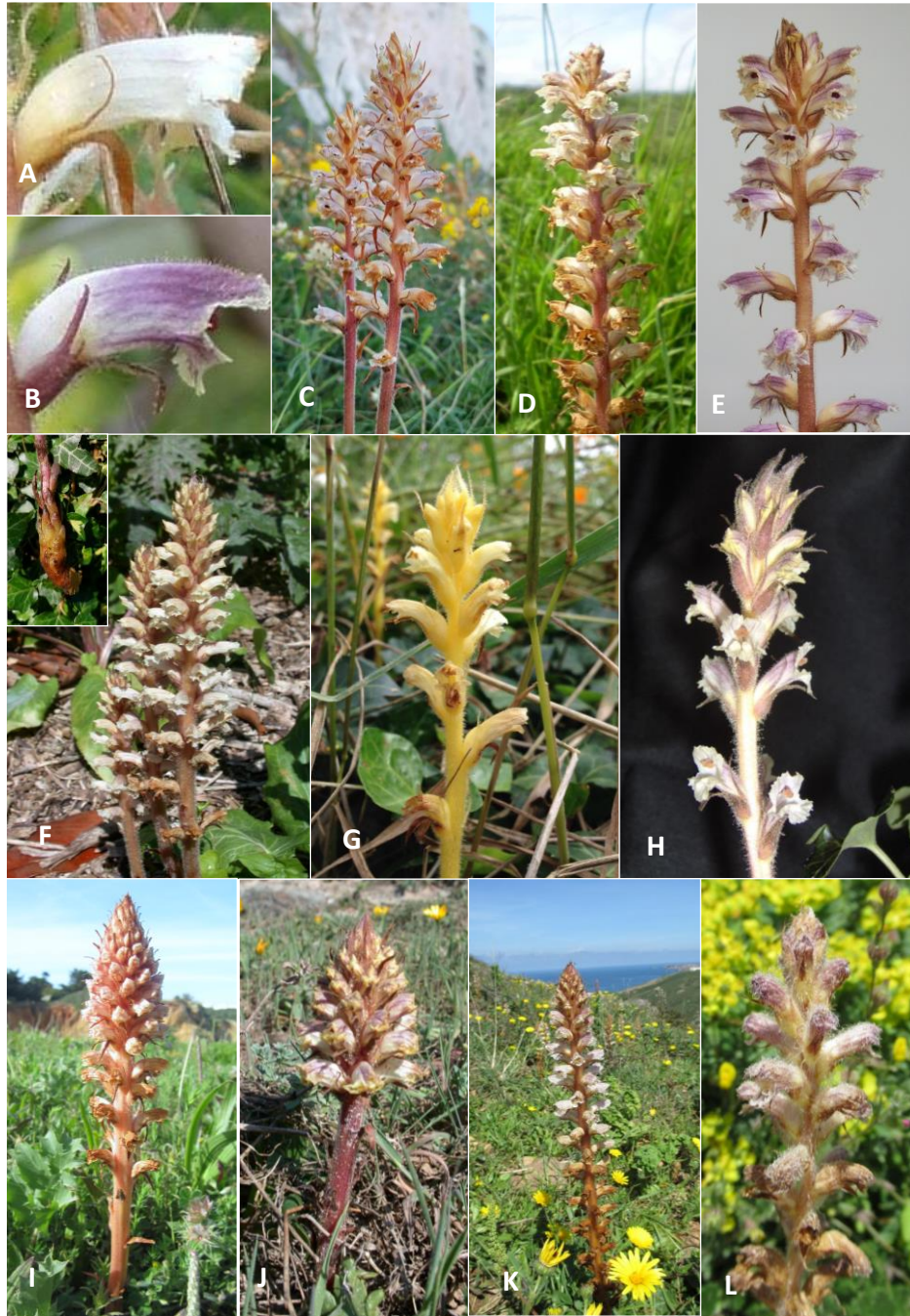
Figure 2. Closely related species in the subsection Minores (Beck) in the UK and continental Europe. A. Corolla of Orobanche picridis . B. Corolla of O. minor . C. O. picridis (habit in east Kent). D. A morphological intermediate of O. picridis and O. minor at St. Margaret's Bay, Kent. E. An artificial hybrid of O. picridis x O. minor . F. O. hederae on a cultivated Eryngium (inset: stem base of specimen growing on Hedera helix ). G. O. hederae f. monochroa growing on H. helix . H. An artificial hybrid of O. hederae x O. minor ; I. O. amethystea on Eryngium campestre in southern Portugal; J. Putative O. litorea on Plantago on the Atlantic coast of Portugal where it co-occurs with (K) O. calendulae on Calendula suffruticosa . L. O. pubescens in Crete – a species similar to, and much confused with, O. minor .