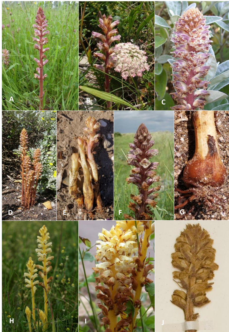
Figure 1. Intraspecific taxa of Orobanche minor in the British Isles. A. Orobanche minor subsp. minor var. minor growing with its typical host and habitat, Trifolium pratense on chalk grassland. B. O. minor subsp. maritima beside its host Daucus carota subsp. gummifer on sea cliffs in Dorset. C. O. minor subsp. minor var. heliophila showing the typical dense, robust inflorescence and clumped habit (D) and (E). F. O. minor subsp. minor var. pseudoamethystea growing with Crithmum maritimum at Sandwich in Kent, and uprooted to show the bulb-like stem base (G). H. O. minor subsp. minor f. lutea . I. O. minor identified as 'var. flava ' originally from Newport Docks in South Wales, in cultivation at the University of Bristol Botanic Garden (note the dense, sub-globose head similar to the following taxon). J. O. minor subsp. maritima var. hypochoeridis collected from its only known site in Jersey, where it may now be extinct.