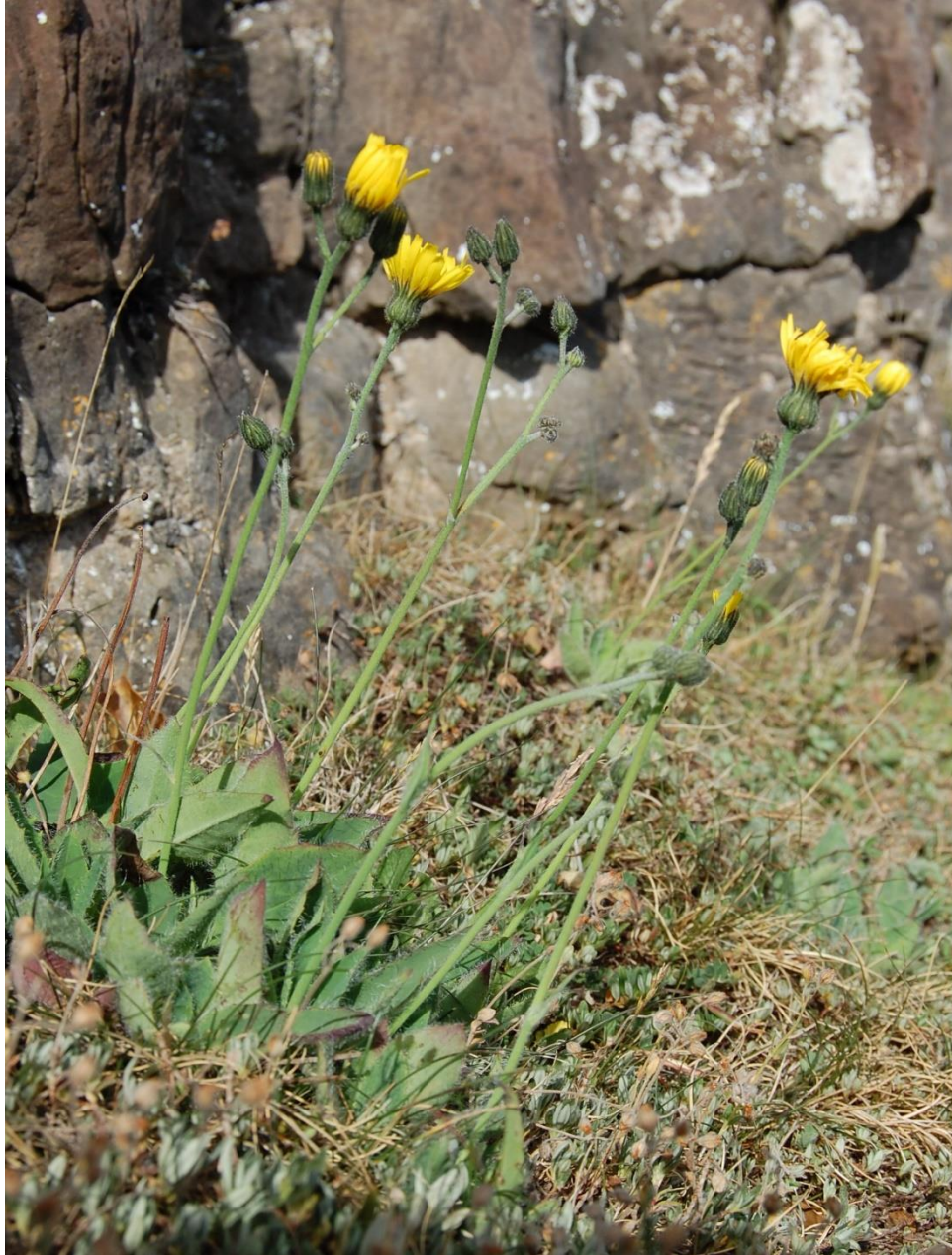
Figure 2. Hieracium britannicoides . Bryn Euryn (type locality)

In North Wales, H. britannicoides is readily distinguished from H. britanniciforme by its smaller size and the absence of spotting on the leaves. In a few sites it grows with H. vagense (F. Hanb.) Ley, which is normally easily distinguished by its lacinate leaves but some H. vagense plants in droughted habitats have small, lanceolate, acute more or less untoothed leaves which can then be distinguished by having dense glandular hairs and few simple hairs on the involucral bracts ( H. britannicoides bracts are greyish-hairy due to the numerous simple hairs with white tips). Hieracium pseudoleyi (Zahn) Roffey also occurs with it on parts of the Great Orme and Little Orme; this is distinguished by its narrower leaves (Sawtschuk et al. , 2008).