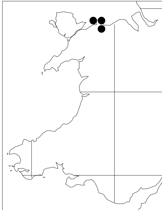
Figure 4. Distribution map of Hieracium britannicoides .

At least 61 plants occurred in scrappy CG3 Bromus grassland on the rocky edges at the top of the quarry cliff, with some plants on the quarry faces. No plants were found on adjacent rocks at Ty Mawr (SH8877) or above Isallt (SH8976).