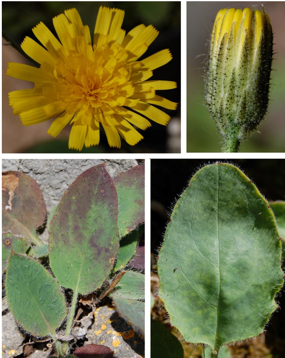
Figure 3. Hieracium britannicoides , details of heads, buds and leaves.