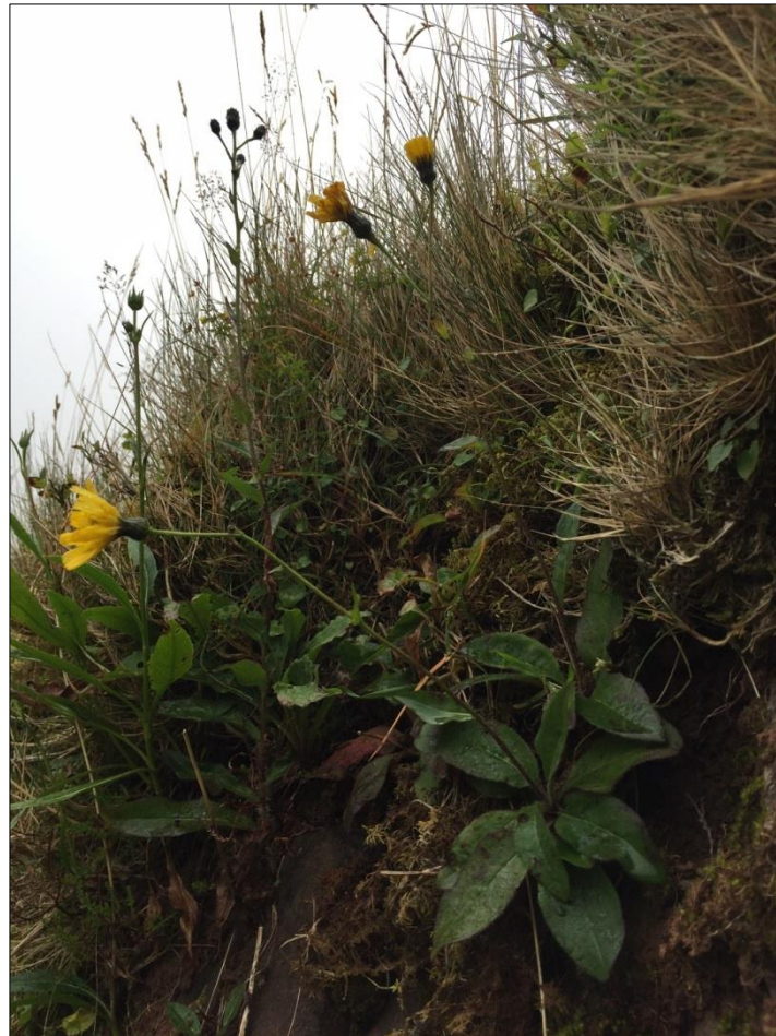
Figure 2. Hieracium breconicola .