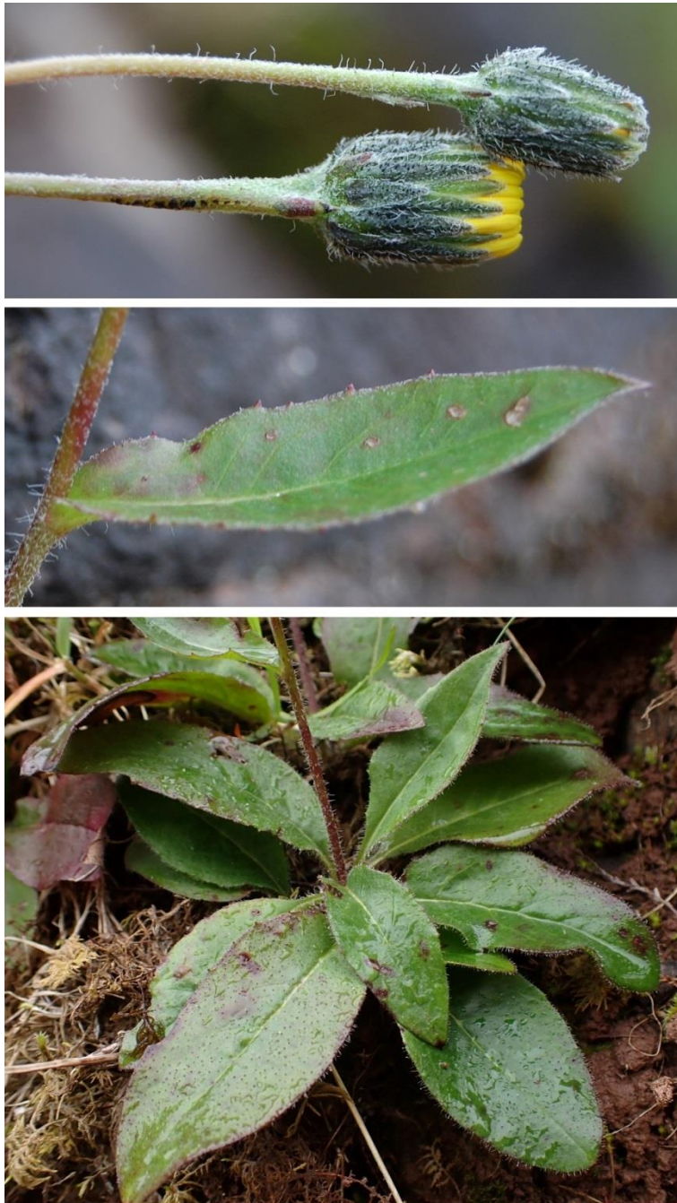
Figure 3. Hieracium breconicola , details of hairs on involucral bracts, stem leaf and basal rosette

Field surveys were carried out in 2009 by S. Lee (née Moore) and updated by T. Rich in 2020. The 'look-see' method (Hill et al. 2005) was adopted for field data collection as it was the most appropriate to survey the sites which had many inaccessible areas on cliffs, thus the number of plants is a minimum. Each site was searched as far as practicable, and the location of the plants recorded using GPS. Soil