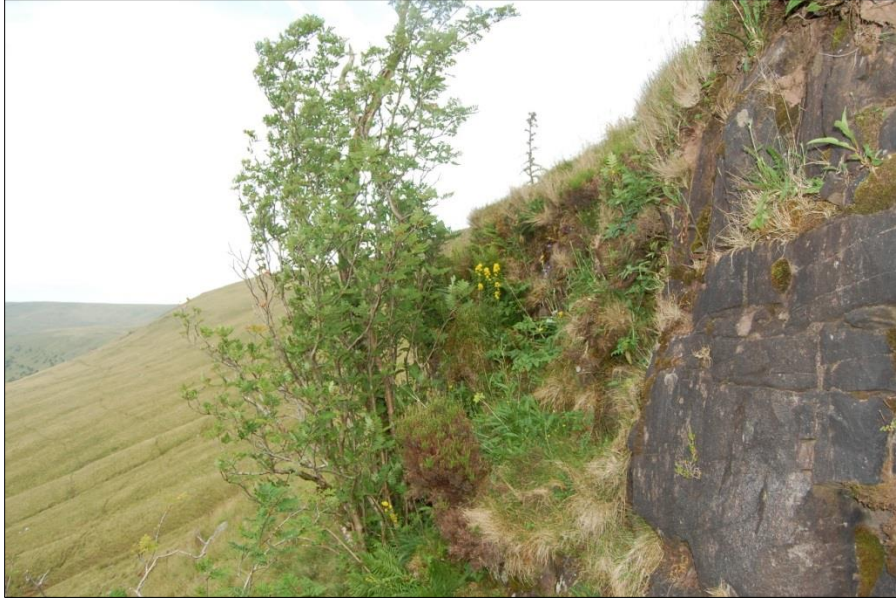
Figure 1. Hieracium breconicola habitat on Fan Nedd