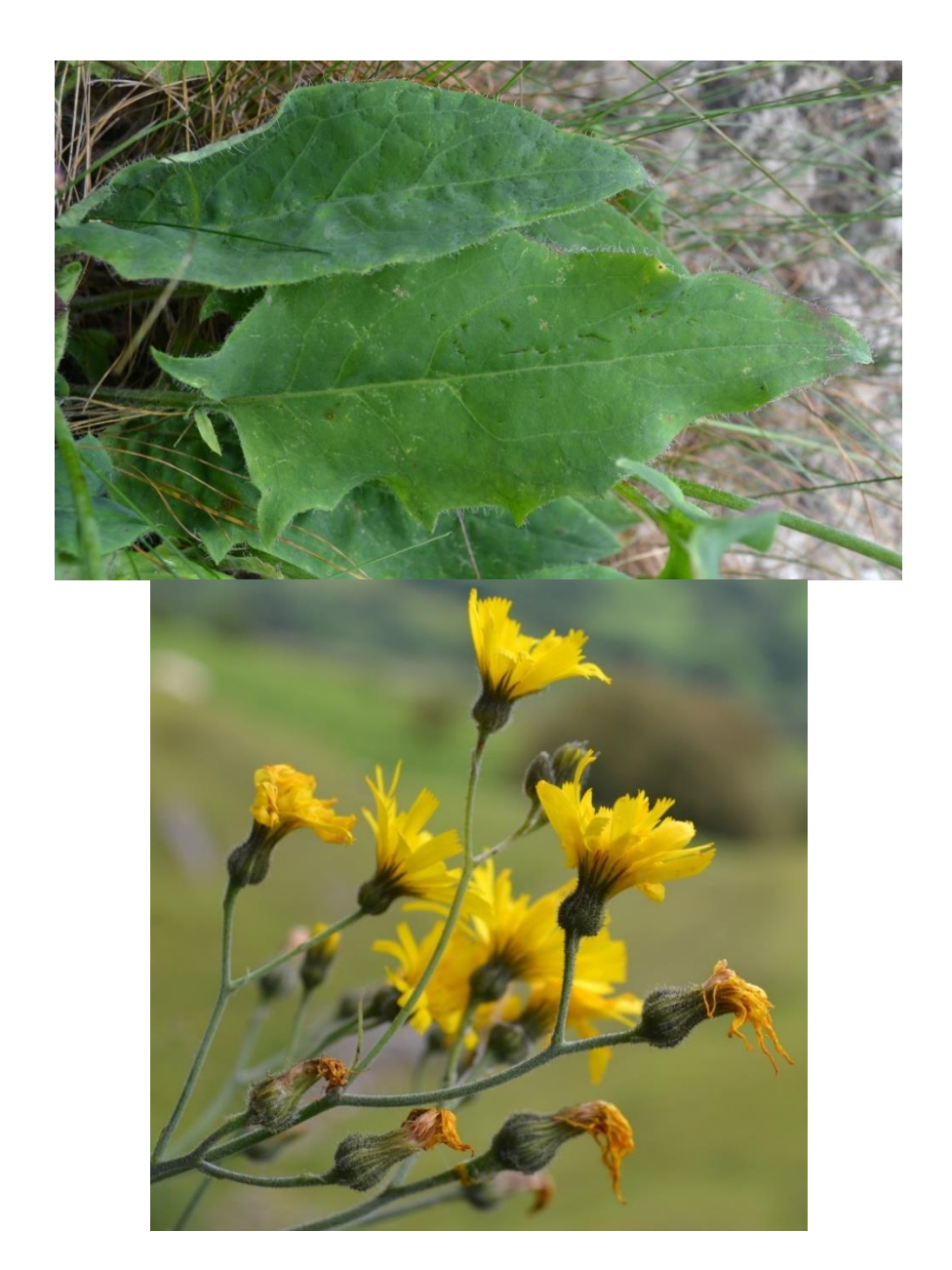
Figure 2. Details of Hieracium subbritannicum showing (above) rosette leaves with large retrorse teeth, and (below) capitula.