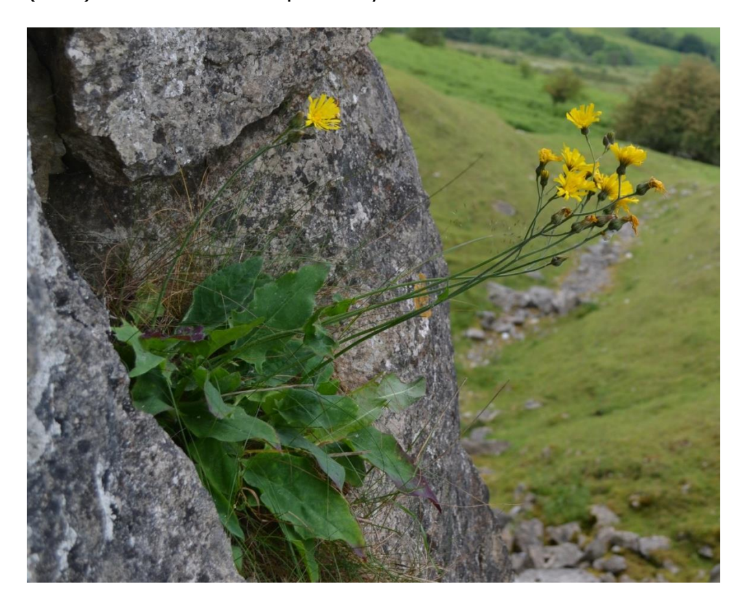
Figure 1. Hieracium subbritannicum. Craig y Cilau (type locality)

summarise the data and assess its conservation status; full details are given by Moore (2009) with a few recent updates by T.C.G. Rich.