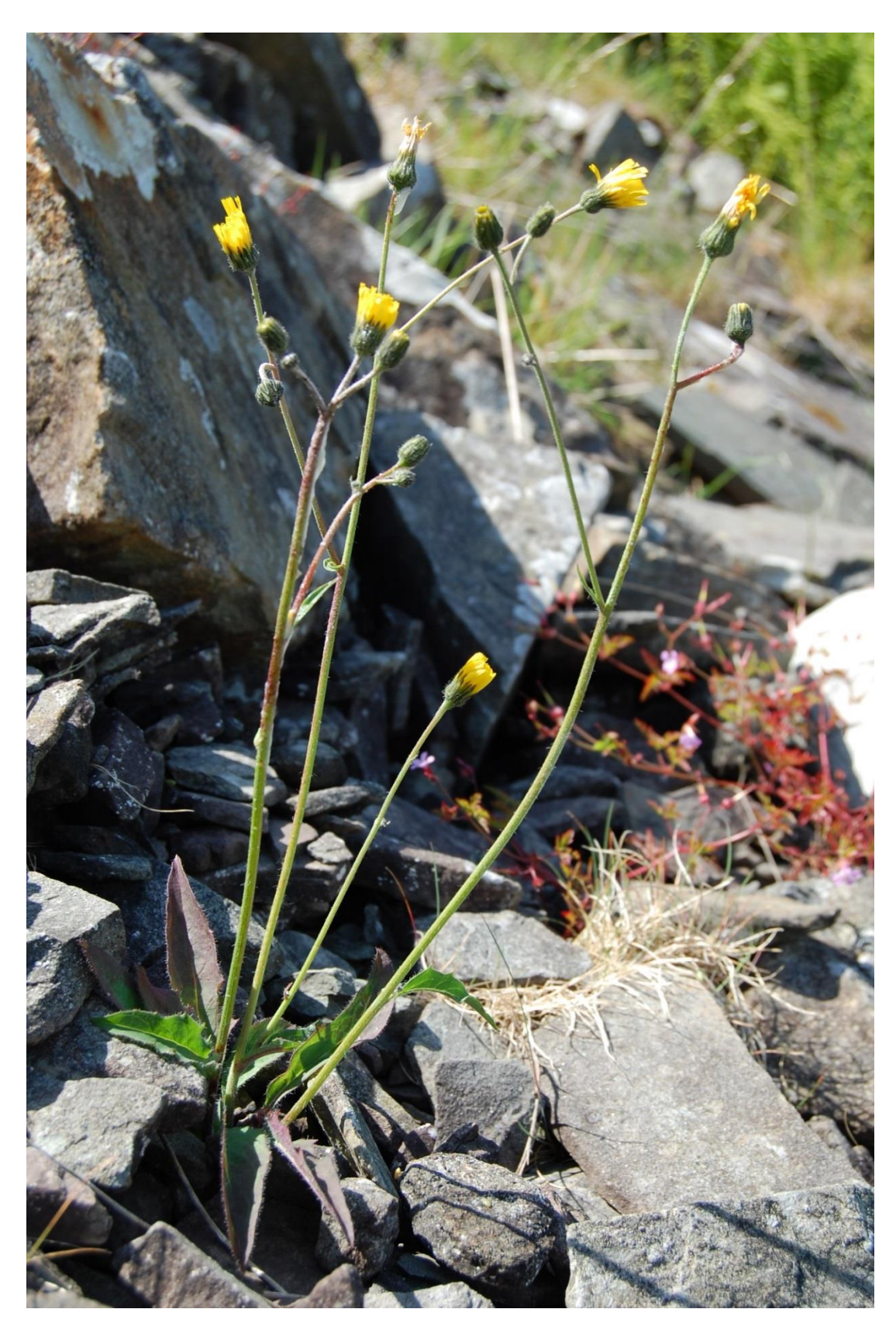
Figure 1. Hieracium angustatiforme plant on basic scree, Craig Cerrig-gleisiad, 23 June 2010.