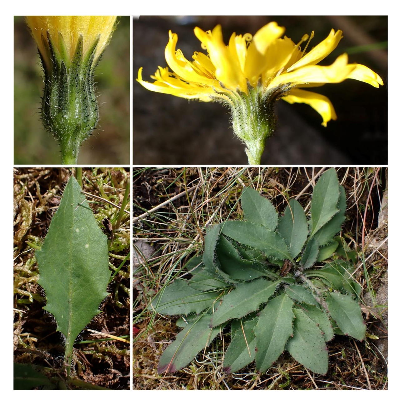
Figure 2. Details of Hieracium angustatiforme capitula and leaves, Craig Cerriggleisiad, 23 June 2010.