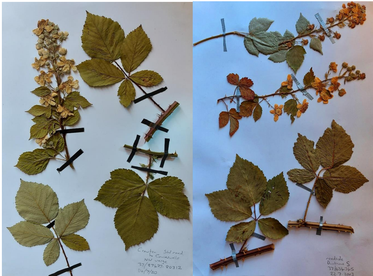
Figure 3. Herbarium sheets from Crawton SW (left, gathered 14 July 2020) and Duntrune S (right, gathered 22 July 2003). Ageing of the latter has caused the green to darken, this having most affected the single lower leaflet of the right-hand upside-down leaf.