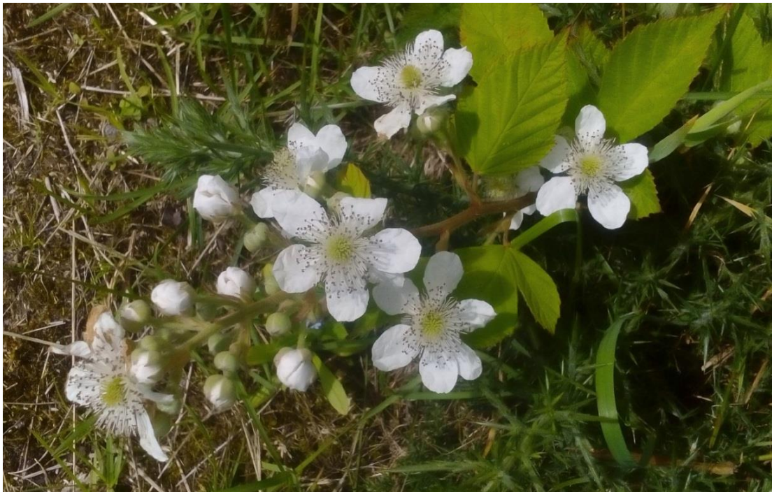
Figure 2. Flowering in Rubus longiflorus . Top: bush at Duntrune N, viewed 13 August 2013; Bottom: inflorescence at Crawton SW, viewed 14 July 2020.