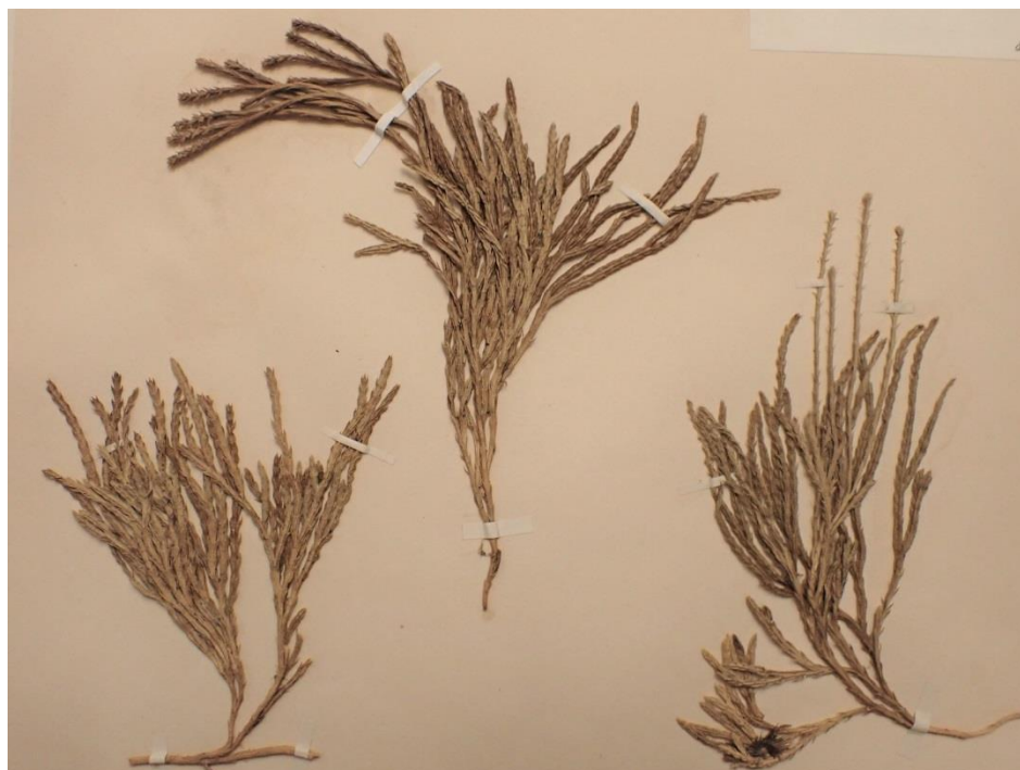
Figure 1. Detail from one sheet of H. P. Reader's Diphasiastrum x issleri collected from Gloucestershire in 1883 and held at BM.

otherwise limestone area and still support an unusual acidophile flora, although in spite of repeated searches the plant has not been refound (Riddelsdell et al., 1948), perhaps as a consequence of coniferisation and one might suspect not aided by over-collection.