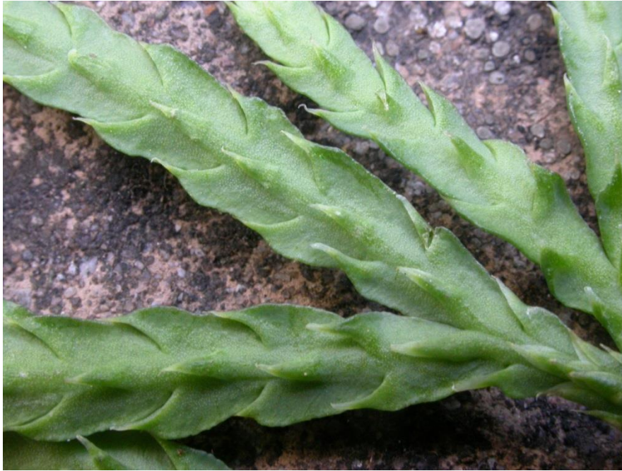
Figure 4. Details of the underside of a Scottish example of true Diphasiastrum x issleri .