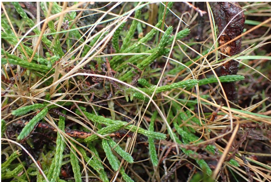
Figure 2. Shade form of Diphasiastrum alpinum , William's Cleugh, v.c. 67 photographed in October 2020 (C. Metherell).

v.c.67 South Northumberland – The Chimneys.