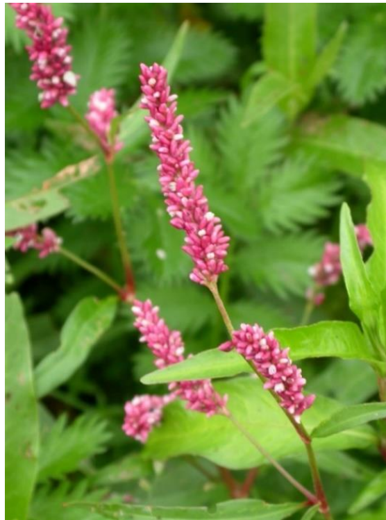
Figure 3. Persicaria lapathifolia subsp. nodosa . Note the long narrow (skinny) inflorescences due to the small achenes (see Fig. 4). Dull pink to mainly strong reddish-pink flowers seen in UK so far.

the very small achenes (Fig. 4, middle; Fig. 5, Row 1), which are also similar in shape to the achenes for all taxa in P. lapathifolia s.l., i.e. they are biconcave, i.e. with a dimple in the middle (Fig. 4, left). In Britain (in my experience) they always appear to be these dull pink to reddish-pink flowered plants. While in need of further investigation, it was noted that the distinct glands on the underside of the leaves were a bright solid (dried?) golden yellow in ' nodosa ', but it is not known if this is related to the hair covering (drying them out) or environmentally induced, or if it is consistent in this taxon only.