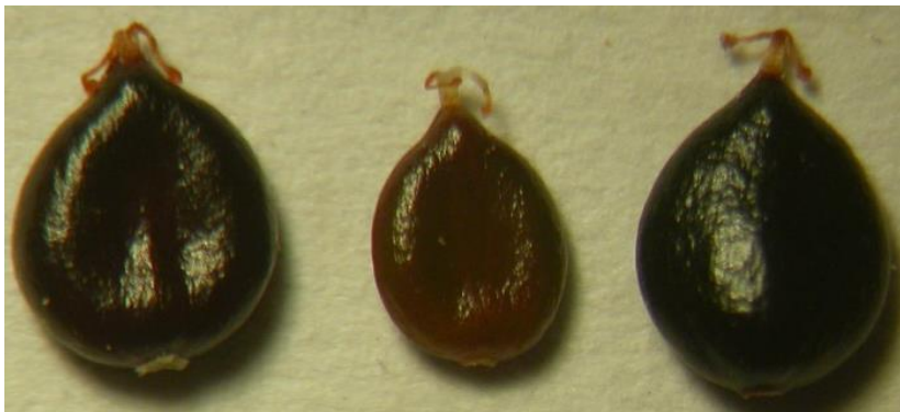
Figure 4. Close up of achenes. Left: P. lapathifolia s.l.; middle: P. lapathifolia subsp. nodosa with achenes c. 1/3 smaller overall; these two are both biconcave whereas P. maculosa (far right) is convex (and some are trigonous achenes, see Fig. 5).

Thus, the main feature separating the two varieties is the density of the hairs on the underside of the leaves. The hair covering is likely to vary from plant to plant and also may become less dense later in the season. Due to self-fertilisation, many plants may be clones of their parent so some characters should be stable, but variation is still likely (possibly also from environmental/habitat modification). Some modes of variation may be stable enough to deserve taxonomic recognition but more extensive studies are needed. Colour variation in flowers may not be a genetically stable character (see below).