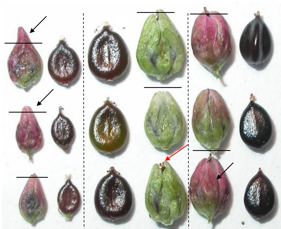
Figure 5. Flowers and achenes of three Persicaria taxa. Left: Persicaria lapathifolia 'subsp. nodosa '; note the distinct 'beak' of the tepals (black arrows) and the achene (and tip of the style) is (always?) shorter than the tepals (see horizontal black lines). Centre: P. lapathifolia 'subsp. lapathifolia ' with the achene ± filling the tepals and at least the style being visible at the apex when parted (see bottom flower, red arrow); Right: P. maculosa - Top pair shows a trigonous achene (not from the flower shown, see bottom flower in this row showing the keeled inner tepal (with a trigonous nut inside), arrowed) and the other two show the biconvex achenes which fill the tepals. In P. maculosa the style is usually just about equal to or just protruding from the apex of the tepals.

It is clear that Flora Nordica (Jonsell 2001) and Wisskirchen (1995) include any subsp. ' nodosa ' type plants (as I described here from Britain) within P. lapathifolia subsp. lapathifolia , suggesting a more variable plant.