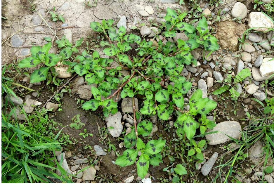
Figure 6. Persicaria lapathifolia subsp. brittingeri

Prof Wisskirchen provides his assessment as: “ Polygonum mesomorphum - Judging from the knowledge of Danser’s ‘ Polygonum mesomorphum ’ original material ( L, GB ) I could not decide whether to recognize it as a true taxon and to include it in the key. It was not possible to include it so it would key out fully.” Essentially, it characterizes a transition between the two main ecotypes – in this case mainly between the subsp. lapathifolia and subsp. pallida . Such plants can be found in damp or flooded fields and in reservoirs, sometimes also in sewage ponds or at ruderal sites. The only tangible characteristic is a fruit size of approx. 2-2.5 mm (as long as wide), which stands between the two main types. Since the character of fruit size is not really reliable (Wisskirchen 1991) and the overlap here is quite large, it seems to me that the taxon ‘ mesomorphum ’ is too weakly characterised to be able to exist independently. However, a final evaluation is still pending. In a later email he suggested it could be a recognisable taxon